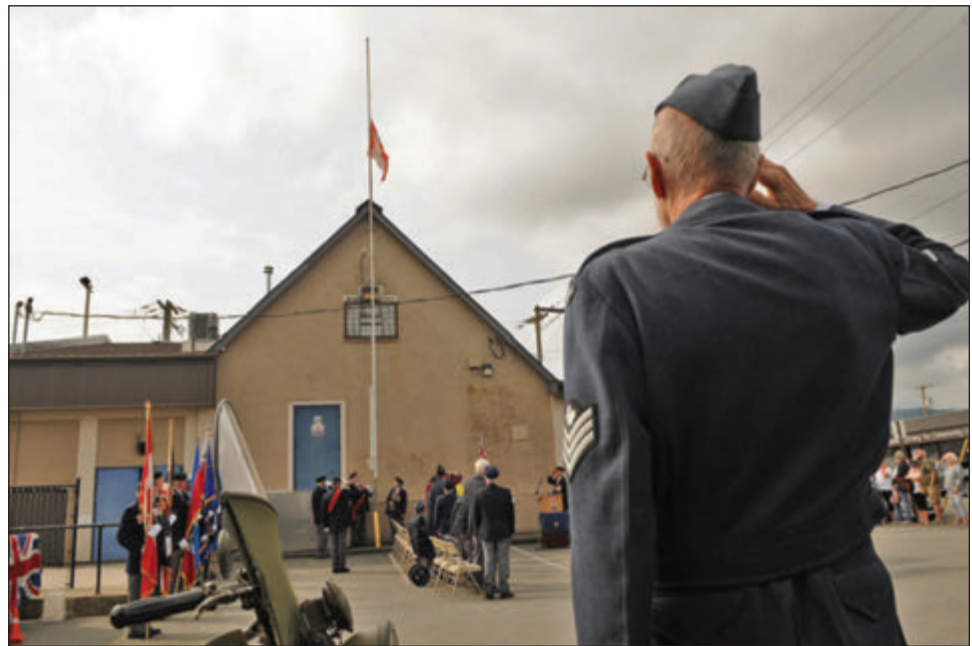
Sept. 10 • A Royal Canadian Air Force veteran salutes as the Canadian flag is lowered during the legion closing ceremony at the Royal Canadian Legion Branch 4 on Mary Street.