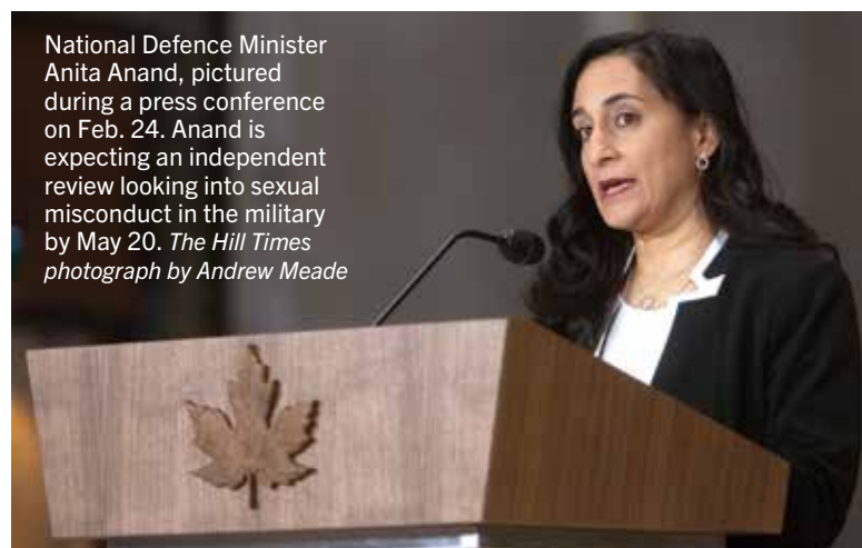
National Defence Minister Anita Anand, pictured during a press conference on Feb. 24. Anand is expecting an independent review looking into sexual misconduct in the military by May 20.